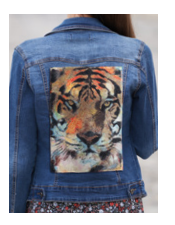
To Fabulous Fashion