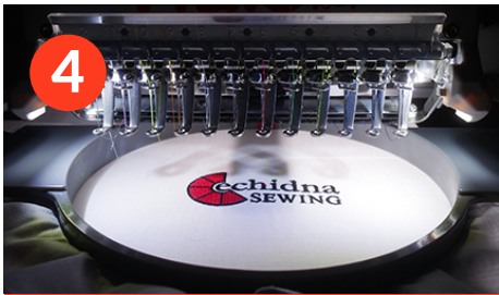
Bright LED Lighting