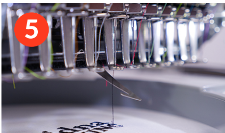
Auto Thread Trimming