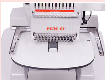
Wide Table Support Platform