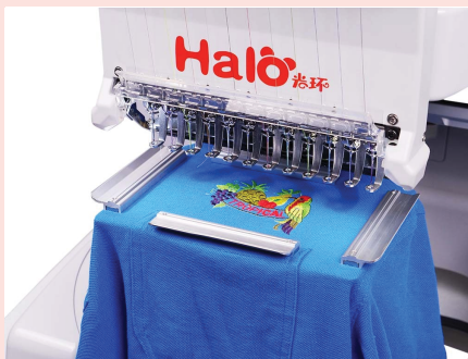
Magnetic Frame Set