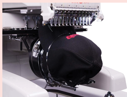
Cap Frame Set & Pocket Frame