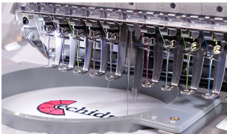
Auto 12 Needles