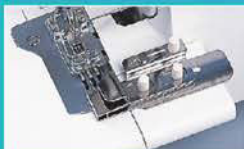
Hemmer guide (for cover stitch)