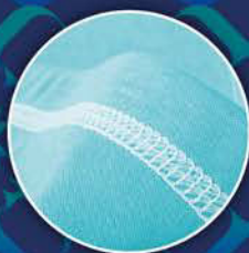
4-thread cover stitch

Various stitches enhance your sewing enjoyment