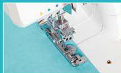
Chain stitch presser foot