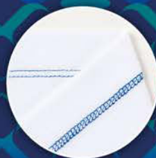
3-thread cover stitch