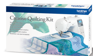
Creative Quilting Kit

For easier handling of fabrics when sewing or working with quilting or large projects.