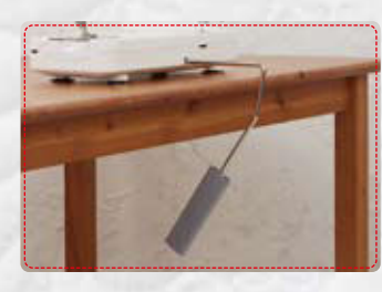
• Knee Lifter Lever The knee lifter lever allows you to lift/lower the presser foot without using your hands. The presser foot can be raised as high as 12mm.