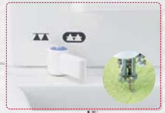
● Drop Feed The feed dog may be raised or lowered by simply adjusting the switch. Lowering the feed dog allows you to free motion quilt in any direction with precision and ease.