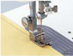
1/4" Compensating Presser Foot (for 120V machine) 7mm Compensating Presser Foot (for 220-240V machine)