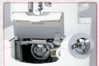
● Horizontal-axis Full-rotary Hook Create perfectly balanced stitches for beautiful seams. Bobbin thread tension is also adjustable.