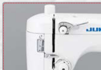
● Presser Foot Pressure Adjustment Presser foot pressure may be adjusted to accommodate different fabric thickness by turning the regulator dial located on the top of the machine.