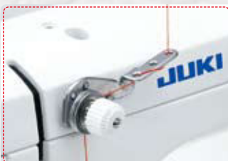
● Sub Tension Unit The Sub Tension Unit ensures thread feeding to the needle is smooth, even and twist free, no matter how thick your thread is. It also keeps the thread from quivering when sewing at high speeds and provides accurate, fine tuned thread tension.