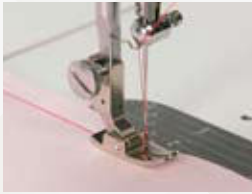
Standard Presser Foot