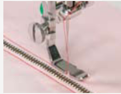
Zipper Attaching Foot