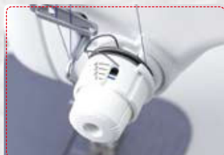
● Thread Tension Scale The machine also has the thread tension scale, which allows you to adjust the tension according to the thread and material to be used.