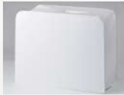
Sewing Machine Cover

Even Feed Foot / 1/5" Quilting Foot / 1/4" Quilting Foot / Quilting Foot Front Open Toe / 1/4" Presser Foot (for 120V machine) / 7mm Presser Foot (for 220-240V machine) / Quilt Guide for Even Feed Foot / Auxiliary Table / Foot Controller / Foot Switch Stopper / Power Cord / Exclusive Screwdriver (2) / Needles (HAx1) / Bobbins (4) / Knee Lifter Lever / Oiler / Spool Cap / Cleaning Brush