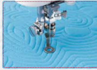
● 1/4" Quilting Foot Create equally spaced free motion quilting lines, perfect for echo quilting.