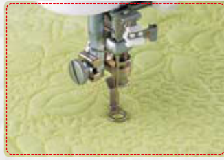
● 1/5" Quilting Foot Use for free motion quilting to glide smoothly and evenly over fabric layers.