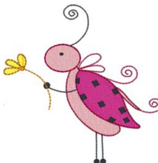
Fancy Bugs - 005 3.74x3.75 inches; 5,379 stitches 3 thread changes; 3 colors