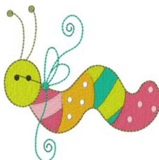
Fancy Bugs - 009 3.74x3.74 inches; 8,571 stitches 9 thread changes; 9 colors