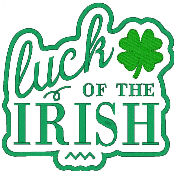
Luck Of Irish Applique Large.pes 195.40x190.20 mm; 30,214 stitches 5 thread changes; 5 colors