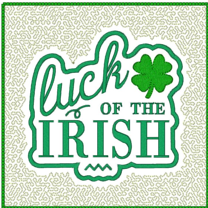
Luck Of Irish Block Medium.pes 198.00x197.60 mm; 28,290 stitches 7 thread changes; 6 colors