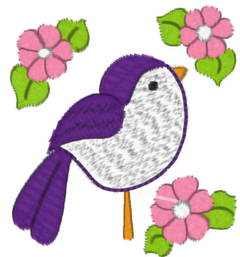
Birds Flowers 10 Large.pes 2.13x2.36 inches; 4,317 stitches 6 thread changes; 6 colors