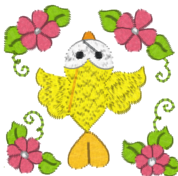
Birds Flowers 08 Large.pes 2.07x2.02 inches; 4,093 stitches 8 thread changes; 7 colors