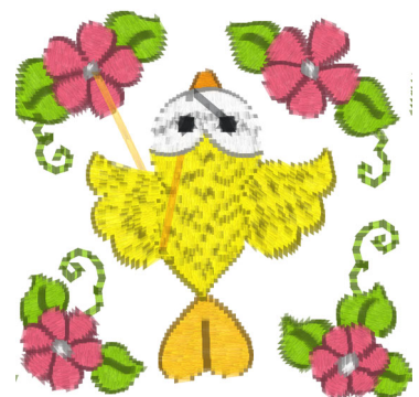
Birds Flowers 08.pes 1.65x1.62 inches; 3,233 stitches 8 thread changes; 7 colors