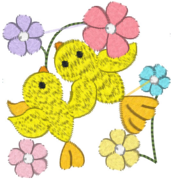
Birds Flowers 06 Large.pes 2.21x2.34 inches; 4,667 stitches 11 thread changes; 11 colors