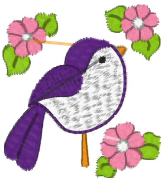
Birds Flowers 10.pes 1.71x1.89 inches; 3,309 stitches 6 thread changes; 6 colors