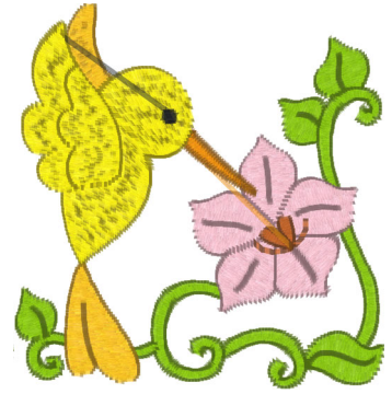
Birds Flowers 07 Large.pes 2.09x2.20 inches; 4,135 stitches 7 thread changes; 7 colors