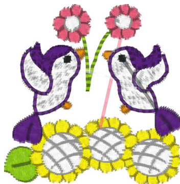
Birds Flowers 09.pes 1.65x1.68 inches; 4,458 stitches 8 thread changes; 7 colors