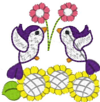
Birds Flowers 09 Large.pes 2.06x2.09 inches; 5,635 stitches 8 thread changes; 7 colors