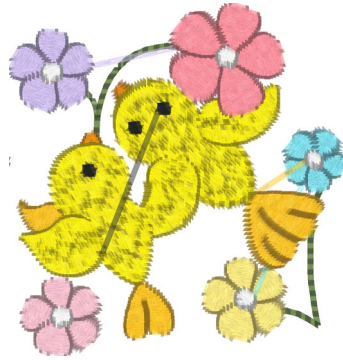
Birds Flowers 06.pes 1.77x1.87 inches; 3,528 stitches 11 thread changes; 11 colors