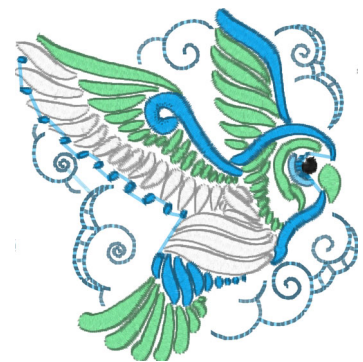
Delicate Owls 08.pes 2.84x2.94 inches; 7,369 stitches 6 thread changes; 5 colors