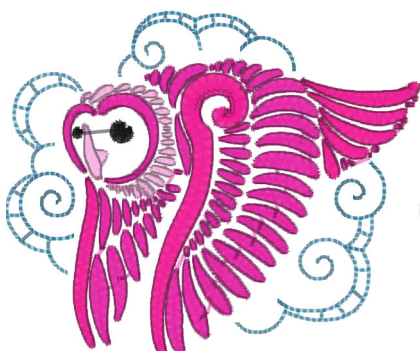
Delicate Owls 10.pes 3.55x2.98 inches; 7,135 stitches 5 thread changes; 5 colors