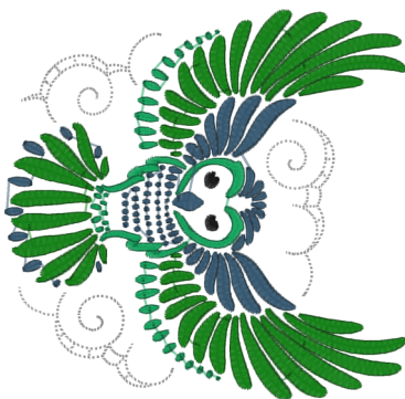
Delicate Owls 09 Large.pes 5.09x4.93 inches; 13,185 stitches 5 thread changes; 5 colors