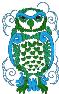
Delicate Owls 07.pes 1.83x2.91 inches; 6,224 stitches 5 thread changes; 5 colors