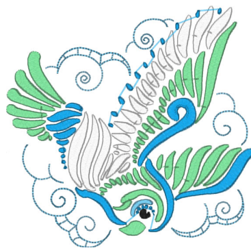
Delicate Owls 08 Large.pes 4.99x4.83 inches; 11,887 stitches 6 thread changes; 5 colors