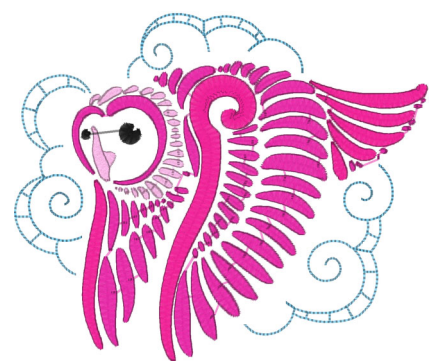
Delicate Owls 10 Large.pes 5.86x4.92 inches; 11,622 stitches 5 thread changes; 5 colors