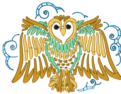
Delicate Owls 06.pes 3.91x2.94 inches; 10,066 stitches 5 thread changes; 5 colors