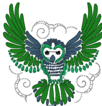
Delicate Owls 09.pes 2.83x2.91 inches; 7,934 stitches 5 thread changes; 5 colors