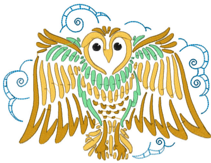
Delicate Owls 06 Large.pes 6.64x5.00 inches; 16,570 stitches 5 thread changes; 5 colors