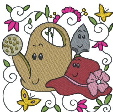
I Love Gardening Blocks - 004.pes 3.76x3.73 inches; 14,575 stitches 15 thread changes; 13 colors