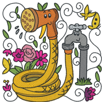
I Love Gardening Blocks - 001.pes 3.76x3.77 inches; 19,670 stitches 19 thread changes; 17 colors