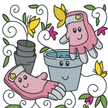
I Love Gardening Blocks - 010.pes 3.75x3.76 inches; 19,030 stitches 17 thread changes; 14 colors