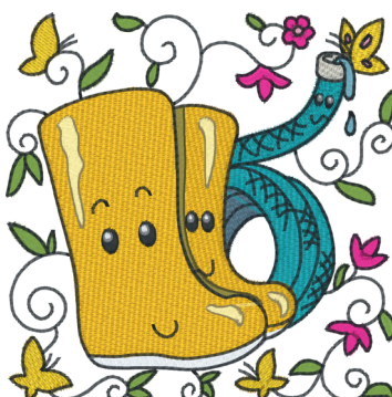
I Love Gardening Blocks - 005.pes 3.73x3.74 inches; 16,022 stitches 15 thread changes; 13 colors