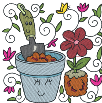
I Love Gardening Blocks - 002.pes 3.75x3.80 inches; 15,833 stitches 20 thread changes; 16 colors