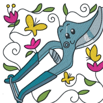
I Love Gardening Blocks - 006.pes 3.74x3.72 inches; 13,300 stitches 16 thread changes; 10 colors