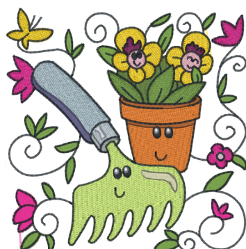
I Love Gardening Blocks - 011.pes 3.68x3.74 inches; 16,102 stitches 21 thread changes; 17 colors