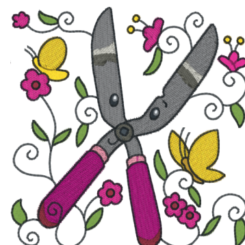
I Love Gardening Blocks - 009.pes 3.75x3.83 inches; 13,074 stitches 16 thread changes; 13 colors