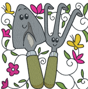
I Love Gardening Blocks - 008.pes 3.74x3.72 inches; 14,747 stitches 14 thread changes; 11 colors