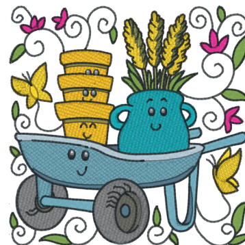
I Love Gardening Blocks - 003.pes 3.75x3.78 inches; 20,868 stitches 17 thread changes; 14 colors