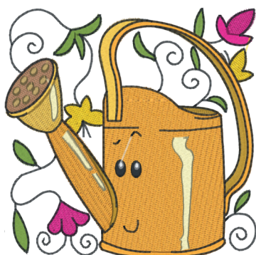
I Love Gardening Blocks - 007.pes 3.75x3.73 inches; 15,456 stitches 13 thread changes; 11 colors