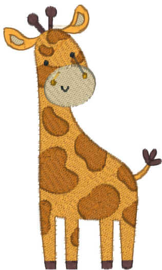
Jungle-07.pes 2.17x3.65 inches; 6,874 stitches 14 thread changes; 7 colors