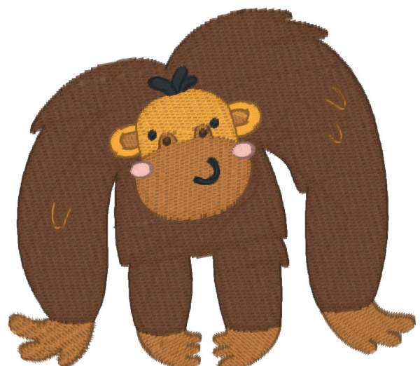
Jungle-06.pes 3.25x2.87 inches; 11,067 stitches 9 thread changes; 5 colors