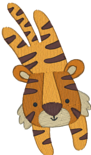
Jungle-05.pes 2.02x3.43 inches; 8,812 stitches 6 thread changes; 5 colors