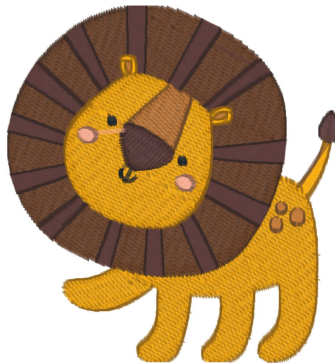
Jungle-08.pes 2.42x2.60 inches; 8,845 stitches 10 thread changes; 6 colors