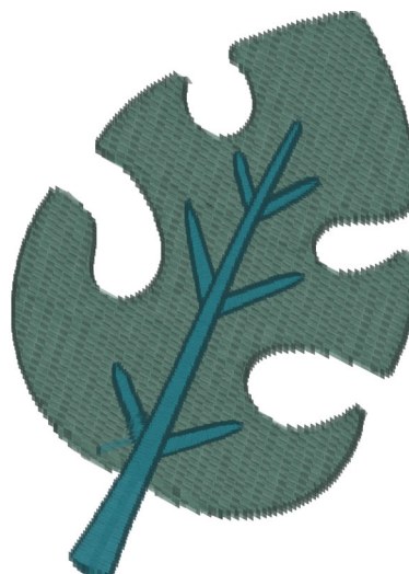
Jungle-10.pes 1.56x2.17 inches; 3,454 stitches 2 thread changes; 2 colors