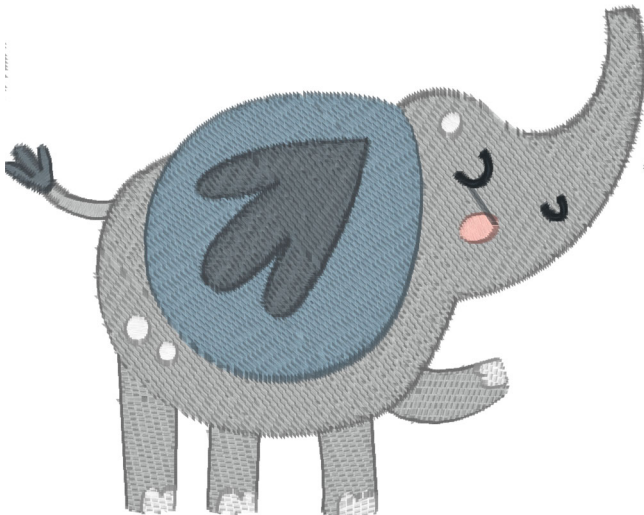
Jungle-03.pes 3.41x2.71 inches; 8,301 stitches 6 thread changes; 6 colors