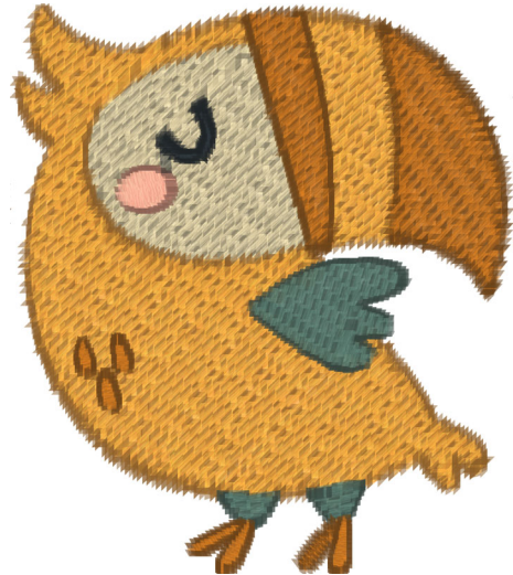
Jungle-02.pes 1.43x1.66 inches; 3,678 stitches 6 thread changes; 6 colors