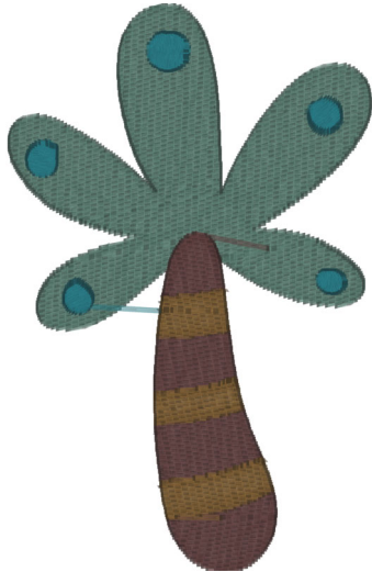
Jungle-01.pes 2.08x3.24 inches; 5,092 stitches 4 thread changes; 4 colors