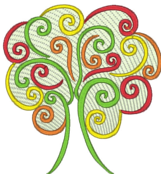
Tree Mylar.pes 3.50x3.76 inches; 9,820 stitches 7 thread changes; 7 colors