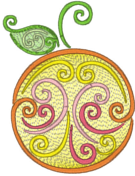
Orange Mylar.pes 2.82x3.69 inches; 8,878 stitches 9 thread changes; 8 colors