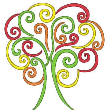
Tree.pes 3.50x3.76 inches; 6,934 stitches 4 thread changes; 4 colors