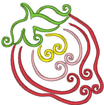
Strawberry.pes 2.57x2.57 inches; 4,084 stitches 4 thread changes; 4 colors