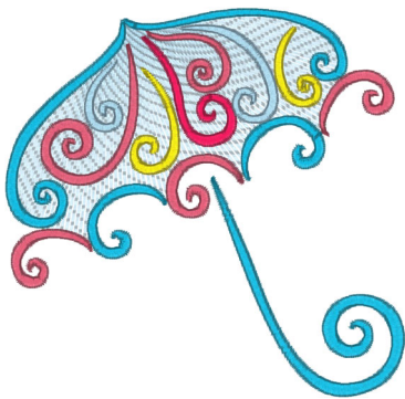
Umbrella Mylar.pes 3.80x3.69 inches; 6,993 stitches 8 thread changes; 7 colors