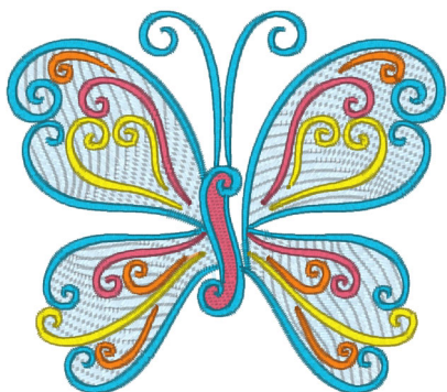
Butterfly Mylar.pes 3.89x3.41 inches; 12,154 stitches 8 thread changes; 7 colors