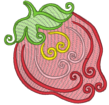
Strawberry Mylar.pes 2.57x2.57 inches; 5,937 stitches 8 thread changes; 6 colors