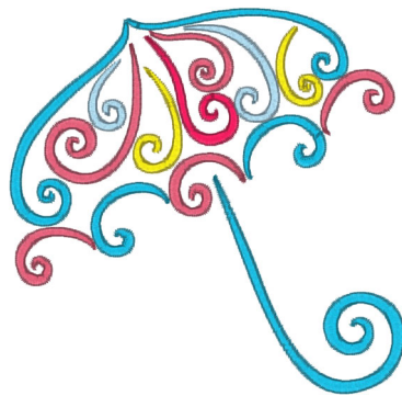
Umbrella.pes 3.80x3.69 inches; 5,340 stitches 5 thread changes; 5 colors