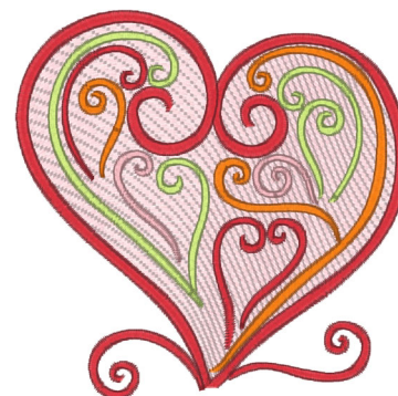
Heart Mylar.pes 3.65x3.61 inches; 10,357 stitches 8 thread changes; 6 colors