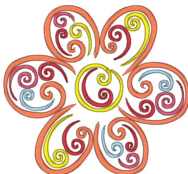
Flower.pes 3.90x3.57 inches; 9,272 stitches 6 thread changes; 5 colors