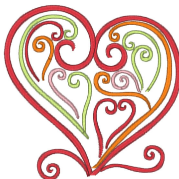
Heart.pes 3.65x3.61 inches; 7,268 stitches 5 thread changes; 4 colors