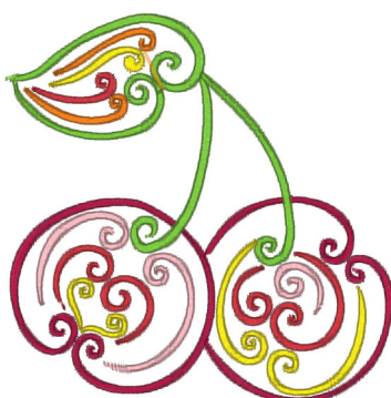
Cherries.pes 3.58x3.61 inches; 7,329 stitches 6 thread changes; 6 colors