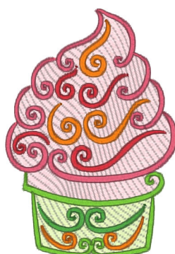
Cupcake Mylar.pes 2.60x3.76 inches; 8,797 stitches 9 thread changes; 9 colors