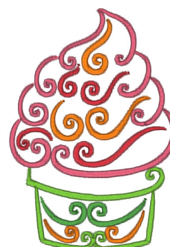
Cupcake.pes 2.60x3.76 inches; 6,230 stitches 5 thread changes; 5 colors