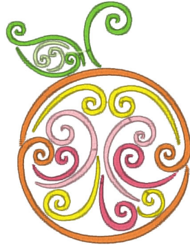
Orange.pes 2.82x3.69 inches; 6,236 stitches 6 thread changes; 6 colors