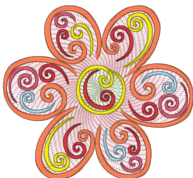
Flower Mylar.pes 3.90x3.57 inches; 12,874 stitches 10 thread changes; 9 colors