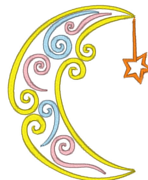
Moon.pes 3.13x3.77 inches; 4,675 stitches 4 thread changes; 4 colors