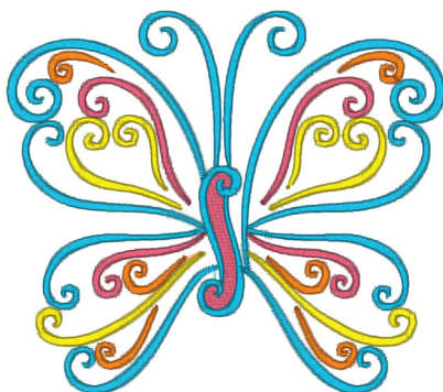
Butterfly.pes 3.89x3.41 inches; 8,941 stitches 5 thread changes; 4 colors