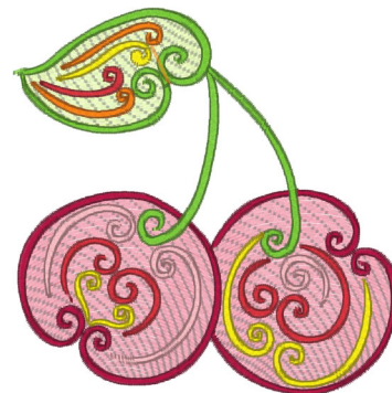
Cherries Mylar.pes 3.58x3.61 inches; 10,019 stitches 10 thread changes; 10 colors