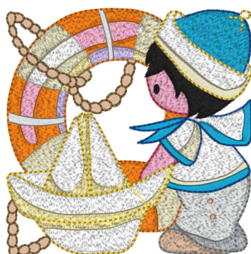
Nautical4.pes 3.69x3.72 inches; 25,605 stitches 28 thread changes; 16 colors