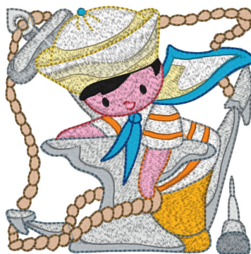
Nautical2.pes 3.74x3.75 inches; 24,814 stitches 28 thread changes; 17 colors