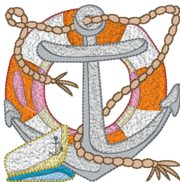
Nautical1.pes 3.71x3.73 inches; 23,691 stitches 16 thread changes; 14 colors