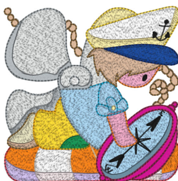
Nautical5.pes 3.72x3.72 inches; 24,633 stitches 34 thread changes; 24 colors