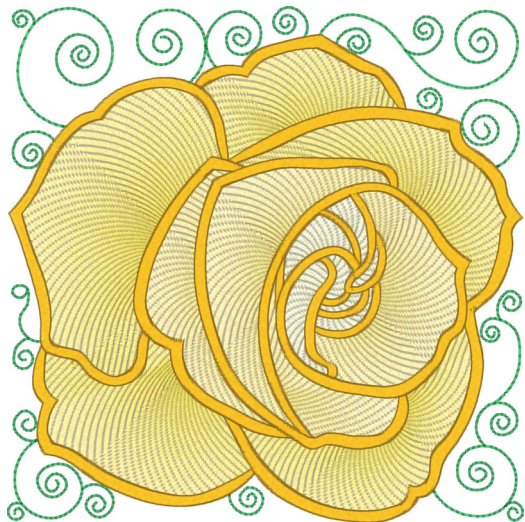
Rose 4 Mylar Large.pes 5.71x5.72 inches; 25,776 stitches 5 thread changes; 5 colors