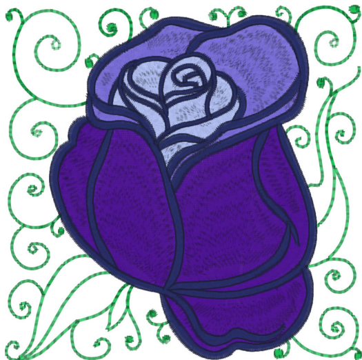
Rose 1 Satin.pes 3.77x3.76 inches; 16,358 stitches 5 thread changes; 5 colors