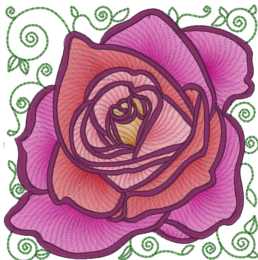
Rose 6 Mylar.pes 3.80x3.82 inches; 16,127 stitches 6 thread changes; 6 colors