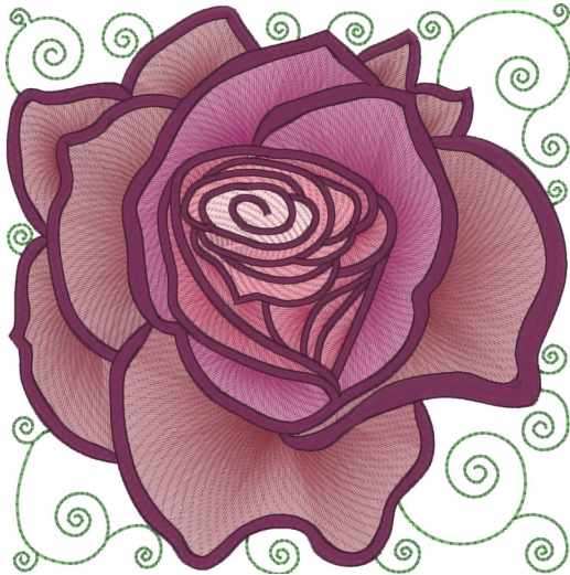
Rose 3 Mylar Large.pes 5.71x5.77 inches; 27,759 stitches 7 thread changes; 7 colors