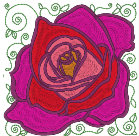
Rose 6 Satin.pes 3.80x3.82 inches; 22,362 stitches 6 thread changes; 6 colors