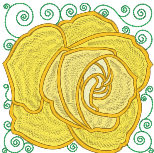
Rose 4 Satin.pes 3.76x3.77 inches; 18,173 stitches 5 thread changes; 5 colors