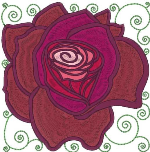
Rose 3 Satin.pes 3.78x3.81 inches; 19,729 stitches 7 thread changes; 7 colors