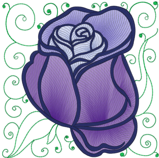
Rose 1 Mylar Large.pes 5.72x5.71 inches; 22,215 stitches 5 thread changes; 5 colors