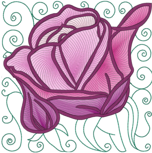
Rose 5 Mylar Large.pes 5.71x5.69 inches; 23,089 stitches 6 thread changes; 6 colors