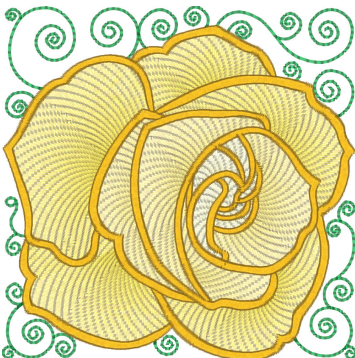
Rose 4 Mylar.pes 3.76x3.77 inches; 13,489 stitches 5 thread changes; 5 colors