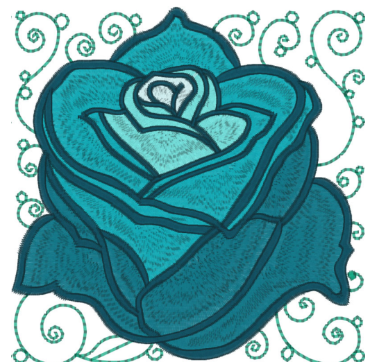
Rose 2 Satin.pes 3.74x3.80 inches; 18,584 stitches 6 thread changes; 6 colors