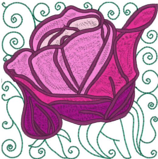
Rose 5 Satin.pes 3.74x3.73 inches; 17,707 stitches 6 thread changes; 6 colors