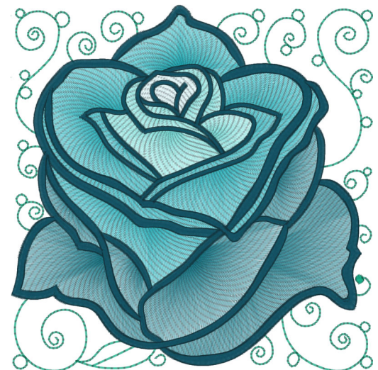
Rose 2 Mylar Large.pes 5.72x5.80 inches; 26,791 stitches 6 thread changes; 6 colors