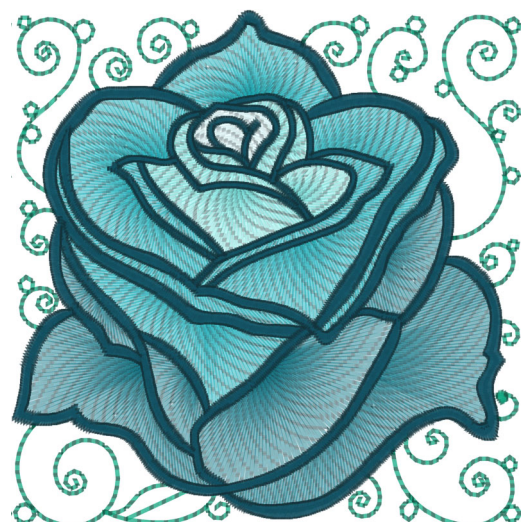
Rose 2 Mylar.pes 3.74x3.80 inches; 14,592 stitches 6 thread changes; 6 colors