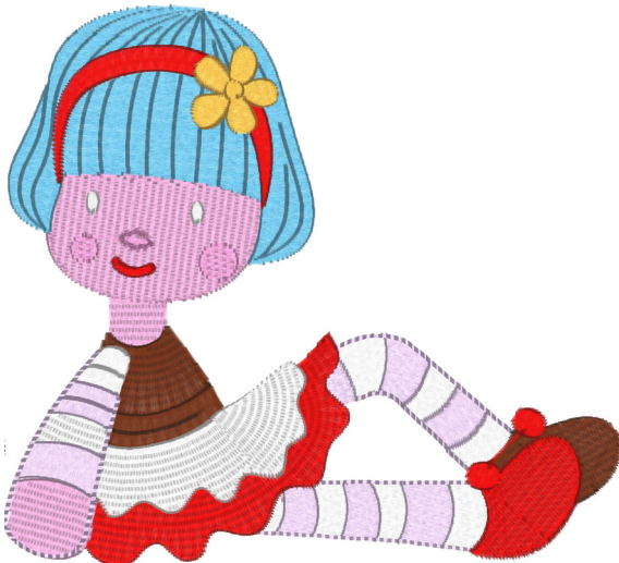
Ragdolls 07 Large.pes 4.63x4.22 inches; 14,598 stitches 14 thread changes; 8 colors