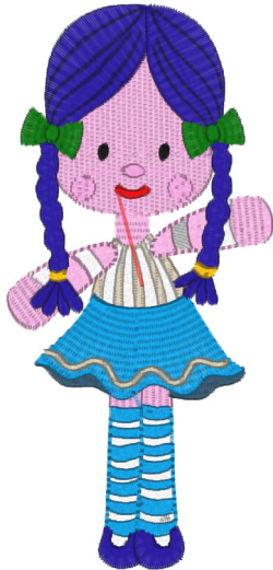
Ragdolls 10 Large.pes 2.26x4.80 inches; 11,926 stitches 13 thread changes; 11 colors