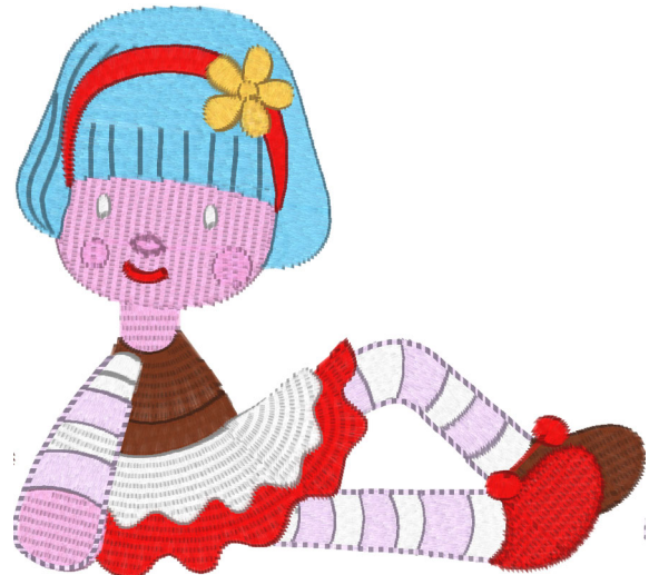
Ragdolls 07.pes 3.71x3.36 inches; 9,582 stitches 14 thread changes; 8 colors