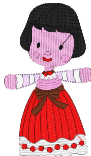
Ragdolls 08.pes 2.17x3.83 inches; 9,995 stitches 12 thread changes; 7 colors