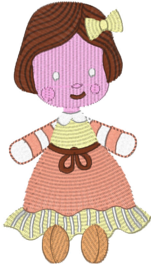
Ragdolls 06 Large.pes 2.43x4.32 inches; 11,486 stitches 12 thread changes; 7 colors