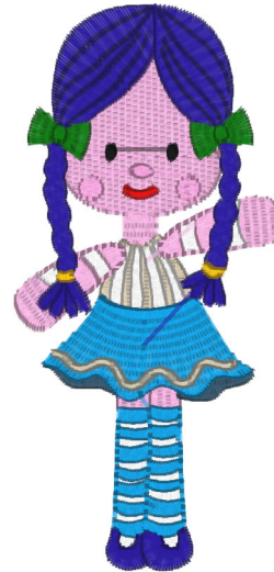
Ragdolls 10.pes 1.82x3.85 inches; 8,783 stitches 13 thread changes; 11 colors