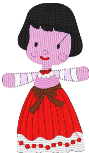
Ragdolls 08 Large.pes 2.71x4.79 inches; 13,334 stitches 12 thread changes; 7 colors