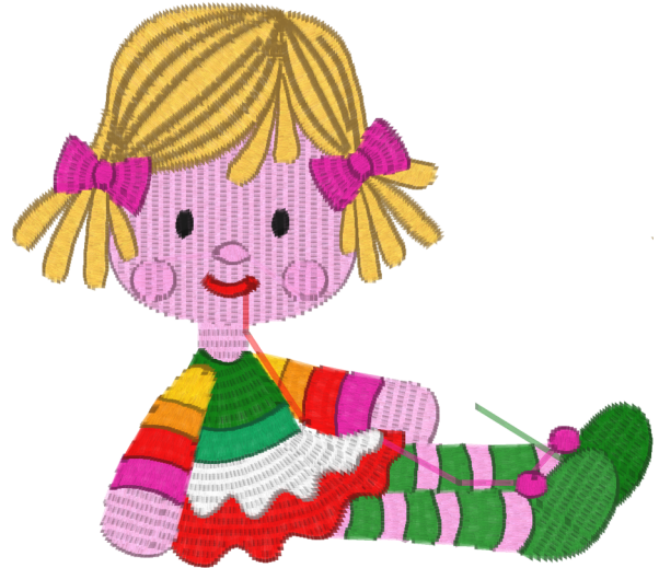
Ragdolls 09.pes 3.34x2.92 inches; 8,977 stitches 19 thread changes; 12 colors