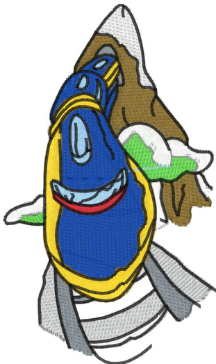
Trains - 009.pes 2.22x3.73 inches; 8,930 stitches 11 thread changes; 10 colors