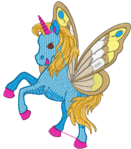
Unicorn 09.pes 3.32x3.84 inches; 11,980 stitches 15 thread changes; 10 colors