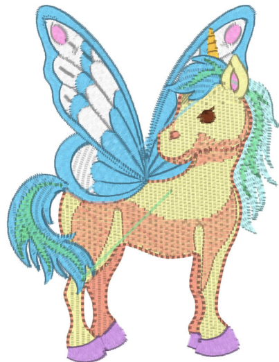
Unicorn 07.pes 2.93x3.84 inches; 13,051 stitches 17 thread changes; 10 colors