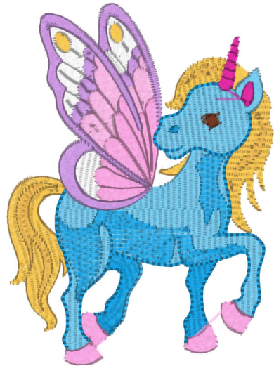
Unicorn 06.pes 2.81x3.84 inches; 13,482 stitches 16 thread changes; 10 colors