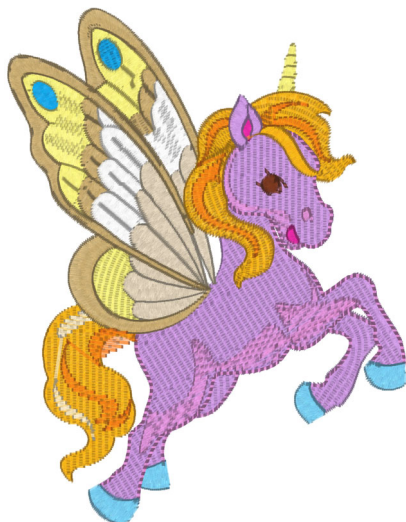
Unicorn 08 Large.pes 3.69x4.80 inches; 17,147 stitches 18 thread changes; 12 colors