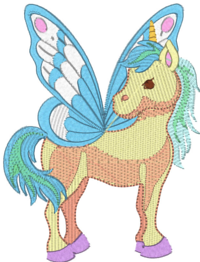
Unicorn 07 Large.pes 3.65x4.80 inches; 18,013 stitches 17 thread changes; 10 colors