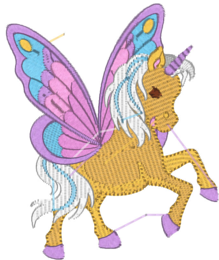
Unicorn 10.pes 3.13x3.81 inches; 12,756 stitches 15 thread changes; 8 colors