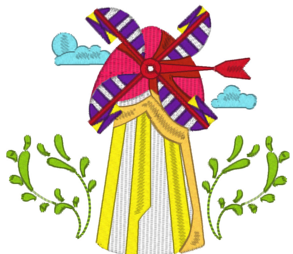
Windmills - 006.pes 3.83x3.38 inches; 16,335 stitches 11 thread changes; 9 colors