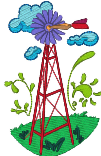
Windmills - 010.pes 2.22x3.57 inches; 7,860 stitches 12 thread changes; 11 colors