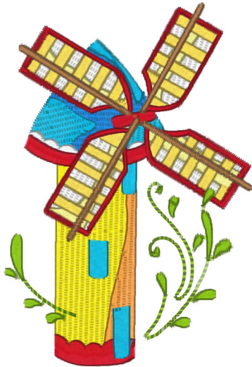
Windmills - 007.pes 2.41x3.56 inches; 11,283 stitches 12 thread changes; 10 colors