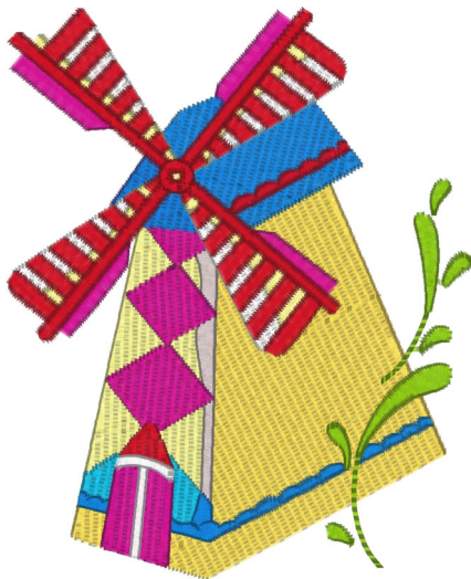
Windmills - 003.pes 2.87x3.54 inches; 12,618 stitches 12 thread changes; 9 colors