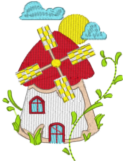
Windmills - 001.pes 2.65x3.56 inches; 8,977 stitches 10 thread changes; 6 colors