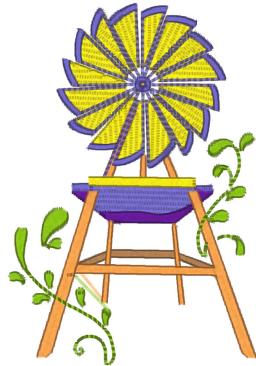
Windmills - 008.pes 2.43x3.55 inches; 8,199 stitches 8 thread changes; 6 colors