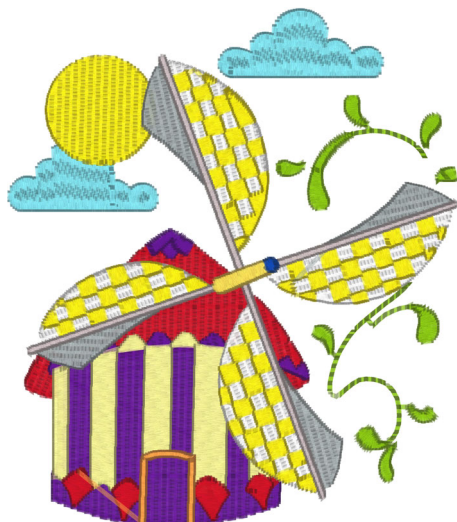
Windmills - 005.pes 3.07x3.55 inches; 14,124 stitches 14 thread changes; 12 colors