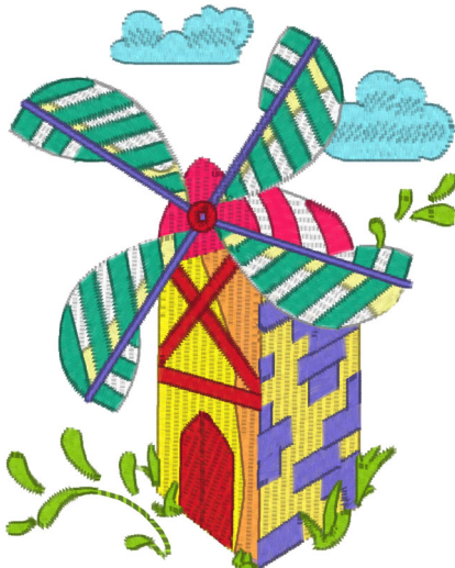
Windmills - 009.pes 2.83x3.57 inches; 11,908 stitches 14 thread changes; 11 colors