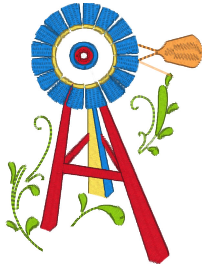
Windmills - 004.pes 2.67x3.58 inches; 6,512 stitches 10 thread changes; 6 colors